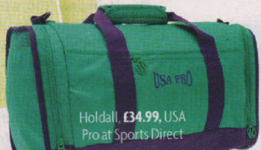
Holdall, £34.99, USA Pro at Sports Direct