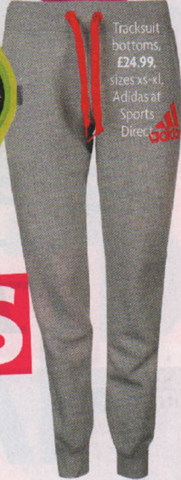
Tracksuit bottoms, £24.99, sizes xs-xl, Adidas at Sports Direct