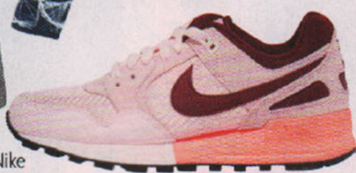
Trainers, £65, Nike