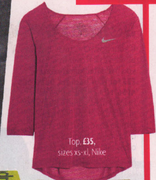
Top, £35, sizes xs-xl, Nike