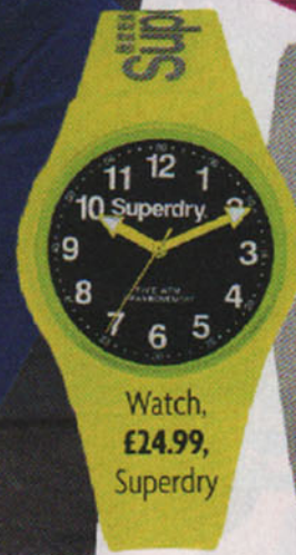
Watch, £24.99, Superdry