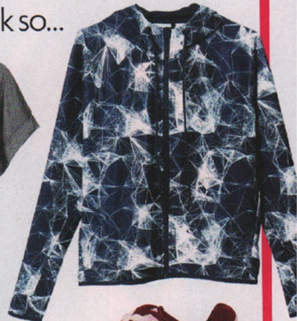
Jacket, £49.95, sizes 2xs-2xl, Adidas