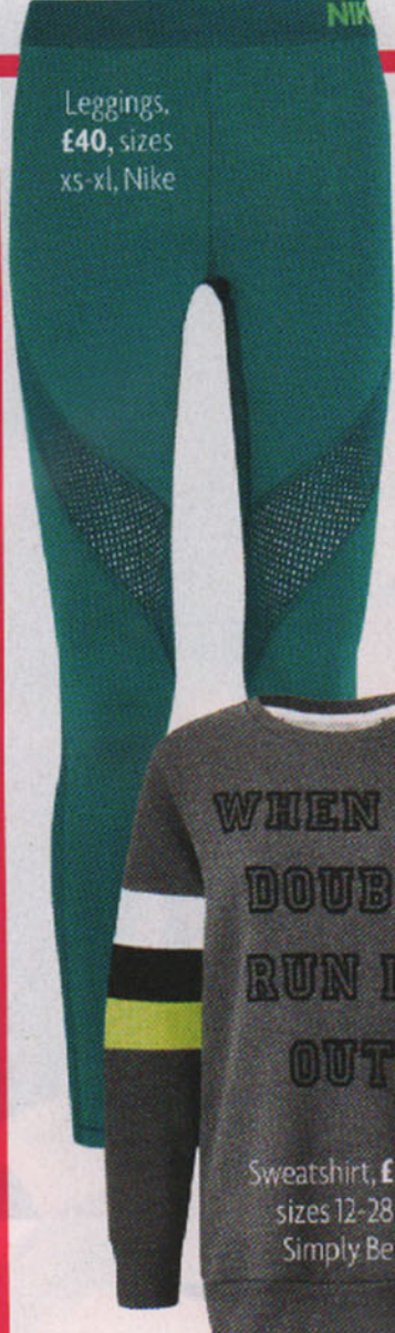
Leggings, £40, sizes xs-xl, Nike