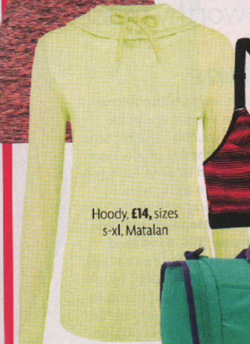
Hoodie, £14, sizes s-xl, Matalan