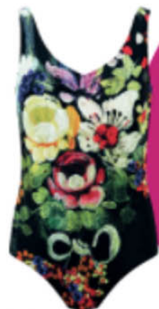
Floral Placement Swimsuit from Cotton Edits , £32

Your style guide to this summer's trend for flowery fashion