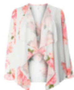
Ivory Floral Kimono from Evans , £26