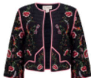
Quilted Embroidered Jacket from Miss Selfridge , £110