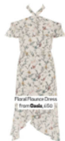
Floral Florence Dress from Qusa , £50