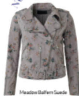
Meadow Baller Suede Biker Jacket from All Saints , £380