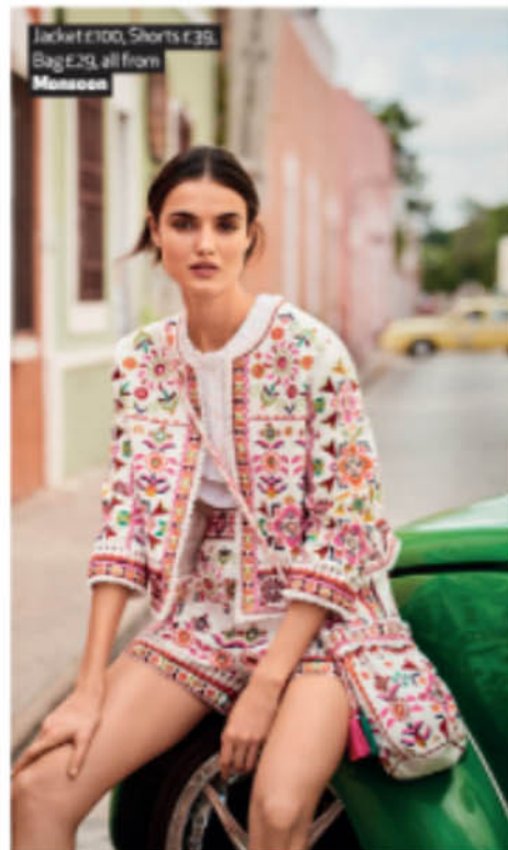
Jacket £100, Shorts £39, Bag £29, all from Monsoon

Botanical prints update covers-ups for a summer-inspired look, with dark hues counterbalancing the softness of the delicate floral print. This summer's must-have is a tossup between the quilted embroidered jacket and the suede biker jacket; transitional pieces that will see you through early autumn.