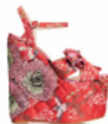
Halo Platform Sandals from KG Kurt Geiger , were £140 now £89