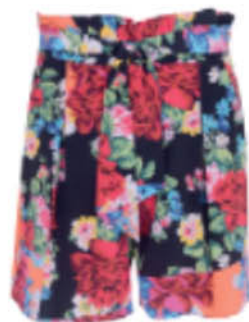
Floral Shorts from Dorothy Perkins , £24