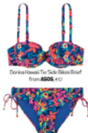
Dorina Hawaii Tie Side Bikini Brief from ASOS , £12

Floral prints are brighter and bolder than ever this summer. Forget dainty petals and opt for oversized blooms instead. From jumpsuits to playsuits, lightweight pyjama-inspired two pieces or edgy matching short and top combos, and everything in between, 'notice me' florals are everywhere this summer. Embrace your dark side by pairing colourful blooms with black.