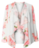
Ivory Floral Kimono from Evans , £20