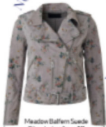
Meadow Ballfern Suede Biker Jacket from ALL Saints , € 380