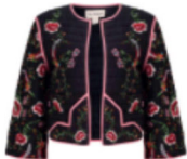
Quilted Embroidered Jacket from Misa Selfridges , £70