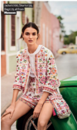
Jacket €100, Shorts €30, Bag €20, all from Monsoon

Botanical prints update covers-ups for a summer-inspired look, with dark hues counterbalancing the softness of the delicate floral print. This summer's must-have is a tossup between the quilted embroidered jacket and the suede biker jacket; transitional pieces that will see you through early autumn.