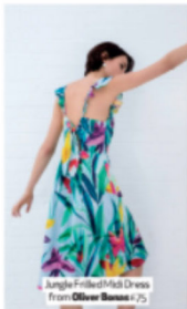
Jungle-Filled Midi Dress from Oliver Bonas , € 25