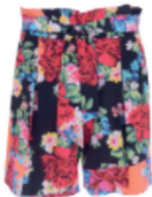
Floral Shorts from Dorothy Perkins , £24